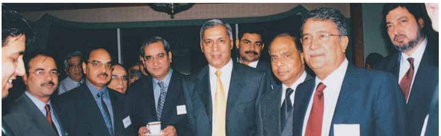
H. E. Shoukat Aziz with PPW Members