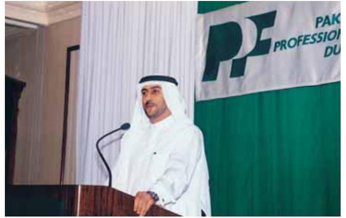
Saeed Al Muntafiq, CEO, Dubai Internet City