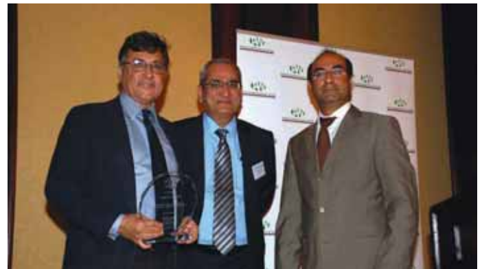
Dr. Pervaiz Hoodbhoy with PPW Chairman