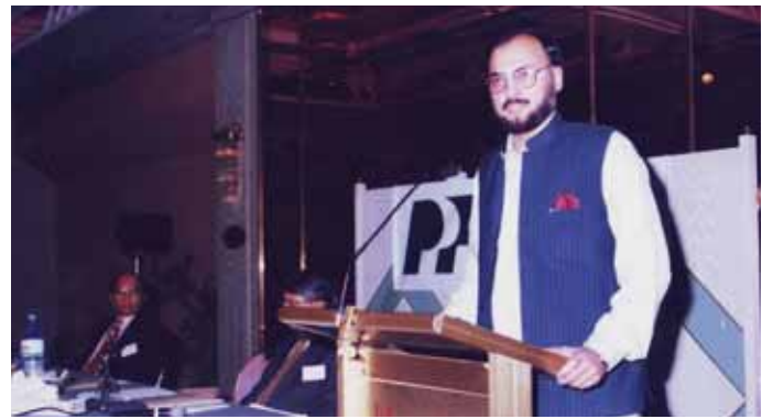
Dr. Ahsan Iqbal