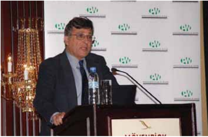
Dr. Pervaiz Hoodbhoy